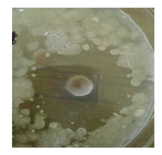
Fig. 4. Antidandruff activity of Ketoconazole against M.furfur.