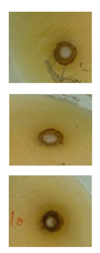
Fig. 5. Antidandruff activity of aqueous extract N.tabacum leaves against M.furfur .