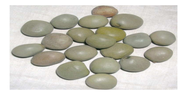
Figure 3. Fresh seed kernels of Bonduc nut.