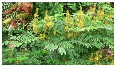
Figure 1. Caesalpinia bonducella Linn.

Division: Magnoliopsida Class: Angiospermae Order: Fabales Family: Fabaceae Genus: Caesalpinia Species: bonducella