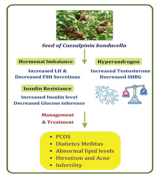
Figure 7. Illustrates how the male and female reproductive hormonal systems are regulated by C. bonducella seeds.

The C. bonducella seed kernels have been found to contain more than 50 different substances. Researchers are investigating the antipyretic, anti-neoplastic, hypoglycemic, and anti-oxidant effects of seed kernel extracts that are high in active chemicals such caesalpinin, cassane furanoditerpenes, flavonoids, bonducellin, terpenoids, and sterols. Recent research has suggested that this plant has anti-androgenic and anti-estrogenic properties, and may be useful in controlling hyperandrogenism, the primary risk factor contributing to several additional clinical symptoms of PCOS<sup>8</sup>.