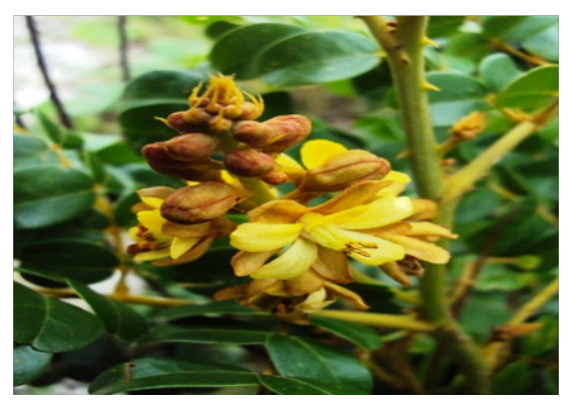
Figure 5. Flower of Caesalpinia bonducella Linn.