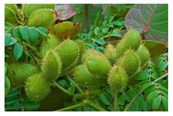
Figure 2. Fresh seed pod of Caesalpinia bonducella Linn.

The seeds are very dry and round in shape; the seed coat is too hard, shiny, and smooth and the hue ranges from greenish to ash grey, as shown in Figure 2. As a result, the plant is pierced by circular and vertical weak crack markings, generating a consistent rectangle to square all over the surface of the seed, which appears oblong and has a length of 1.3 cm. At the receding edge of the seeds, an enlarged hilum with stalk remnants lay in the heart of the black patch. There is an absence of endosperm in seed (exalbuminous). The seed kernel surface is wrinkled and flattened, measuring approximately 1.23 to 1.75 cm in diameter. A micropyle scar can be found at the tip of the kernel, separating the embryo's two cotyledons (Figure 3).As a result, the plemule radical axis is cylindrical, straight and thick. The flavour of the seed is extremely bitter, and the odour is sickening and repulsive<sup>6</sup>.