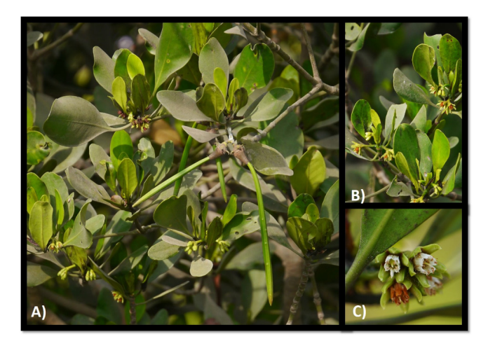
Figure 1. Photograph of C. tagal showing various parts A) fruits with protruding hypocotyl;B) flowering branches with leaves; C) small, white flowers which soon turn brown.

C. tagal is characterized by rounded, slightly elliptic, oblong shaped, glassy-green leaves and the white coloured, small-sized pendulous flowers which appear in clusters of 5-10 terminally (Figure 1). Flowering is generally observed from August to March. Fruits are small in size, club-shaped or ovoid, viviparous, and green in colour from