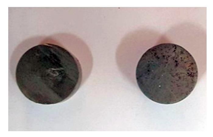
Figure 1: Biocompatibility test samples

Biocompatibility test was carried out by using Magnesium AZ31 and PEEK 450G biomaterials, and samples were prepared by turning operation as per ISO 10993 standards<sup>12</sup>. Figure 1 shows the prepared biomaterials samples.