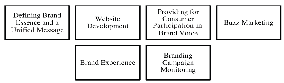
Figure 3: Proposed Six Elements of Online Brand Building

By approaching online branding in a structured manner, marketers ensure that their internet campaigns support their general branding strategy, rather than detracting from it. Organized and integrated efforts towards online branding can deliver the real value to customers, beyond revenue generation (Simmons, 2007).