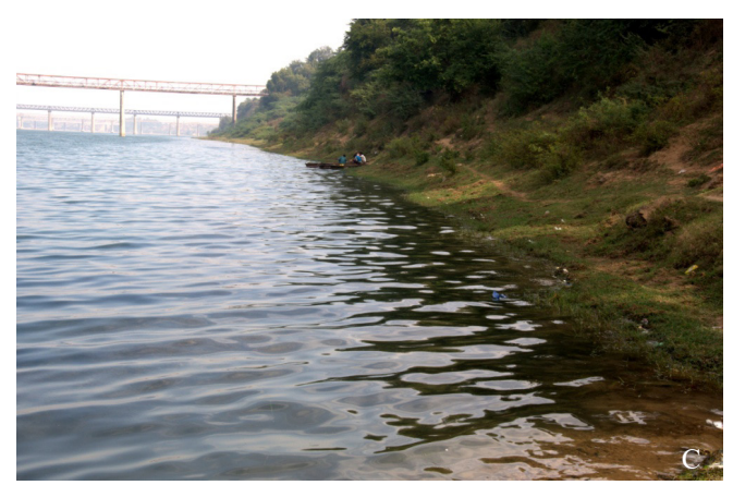
Figure 1. Study sites (A). Sankarda (B). Sindhrot (C). Fazalpur.