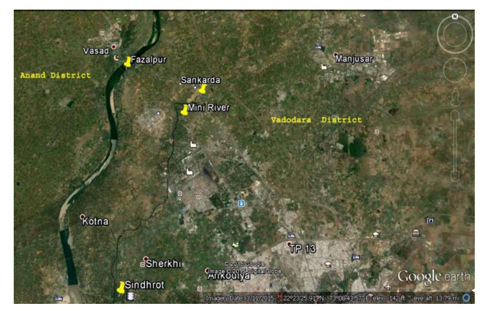
Figure 2. Satellite view of study site.

odonate populations thrived. Output of the studies conducted on three wetland sites Fazalpur, Sankarda and Sindhrot are presented below (Tables 1 and 2).