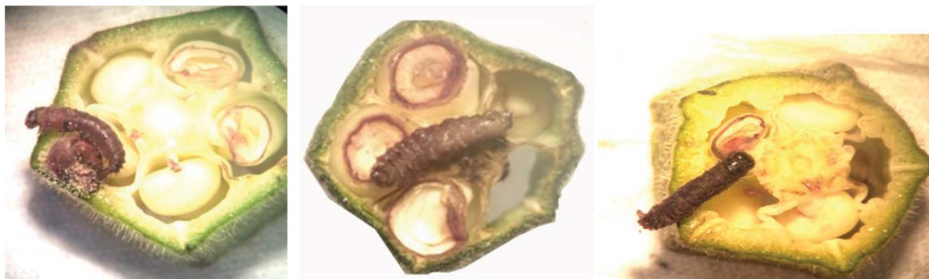
Plate 1. (L to R). Mortality of Earias vittella -panchagavya with oleander seed extract, panchagavya with neem leaf extract and panchagavya with neem seed kernel extract.

The results of the field trial showed that spraying of panchagavya 3% in combination with NSKE 5% was effective. The present finding are confirmatory with Bharati (2005) who reported that panchagavya in combination with NSKE was highly effective in the management the Spodoptera larvae on groundnut and soybean.