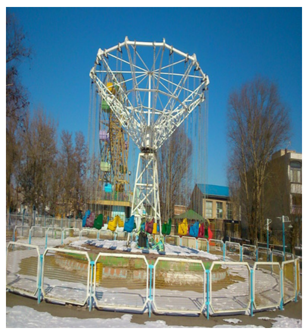
Figure 1. The current status of the Sarab Park is not considered in this area of climate issues, and Sarab City does not provide services to urban users for the most part of the year; winter 2016.