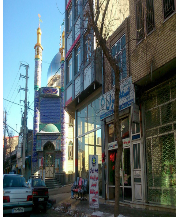
Figure 2. A Survey of Ferdowsi Street in Sarab; due to the current status, there is turbulence in the urban landscape on this street, mainly due to the inadequacy of the walls, lack of attention to the design of the sky line, the lack of green space and urban furniture, low passageways, and no sense of social vitality in the urban environment; photo by Isazadeh; winter 2016.