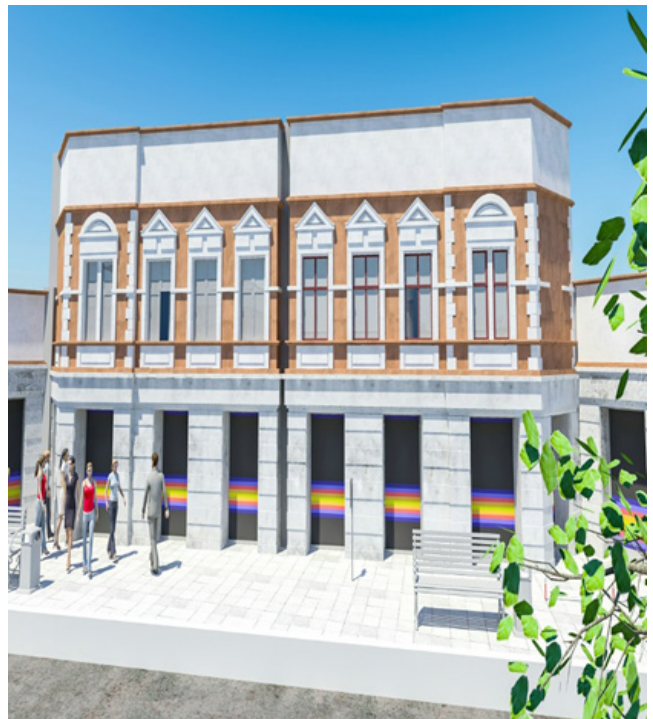
Figure 5. The design proposed for Ferdowsi Street in the city of Sarab with the aim of creating social vitality with the reinforcement of the design of gardens, urban furniture, and green spaces; Isazadeh; summer 2017