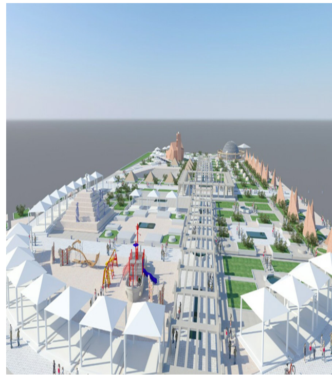
Figure 4. Proposed design for Sarab city Park. The use of green space, watercolor and element and spaces for children to play to enhance social vitality;Isazadeh; summer 2017