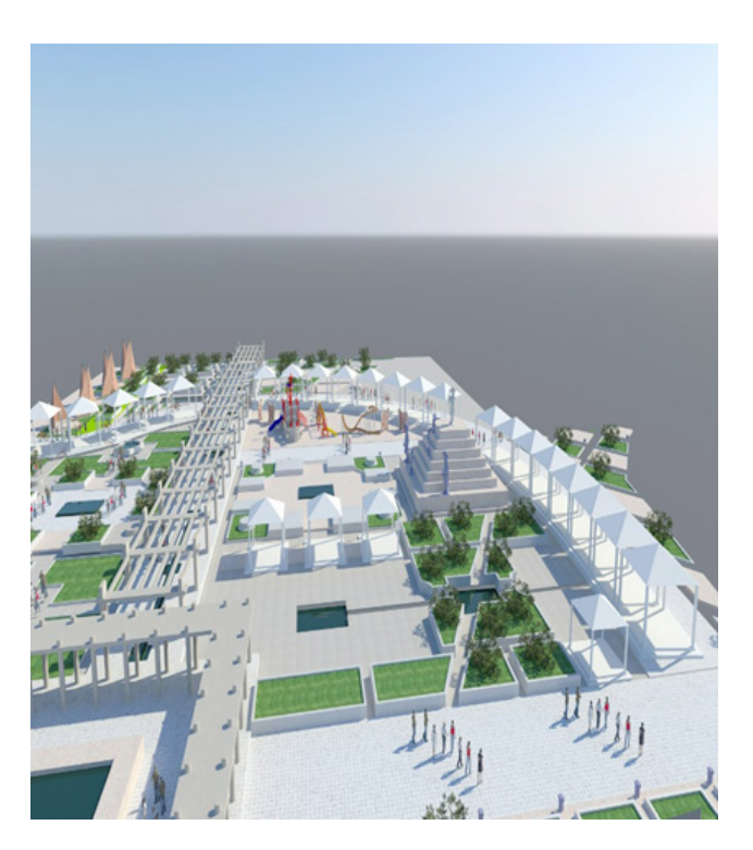
Figure 3. Proposed design for Sarab city Park. The use of roofed elements for the complex due to adherence to the climate of the city of Sarab, Designing the route for walking and morning exercise; Isazadeh; summer 2017.