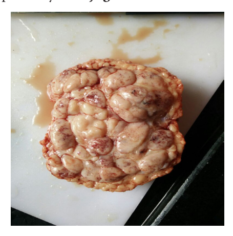
Gross image showing poorly circumscribed soft tissue mass with cut section showing fleshy pale tan appearance. Microscopy images showing anaplastic features in embryonal RMS in 3 yrs old child.

arrangement of tumour cells was noted. Few of tumour cells showed anaplastic features with bizarre nuclei. Occasional stellate shaped cells with elongated nucleus (strap cells) were seen. Immunohistochemically tumor showed positivity for Myogenin and Desmin .