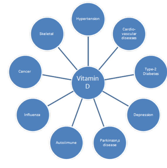
Figure 2. Benefits of vitamin D.

Many studies have shown association between low vitamin D concentrations and increased risk of fractures and falls. Vitamin D receptors are located on the muscle