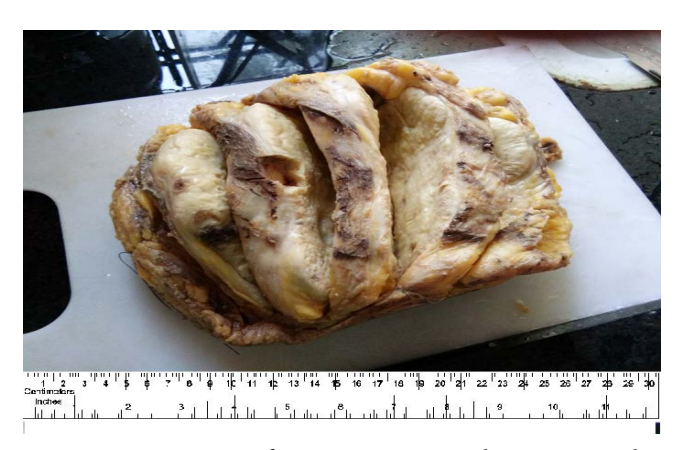
Figure 2. Cut section of Carcinoma Breast showing irregular tumour.