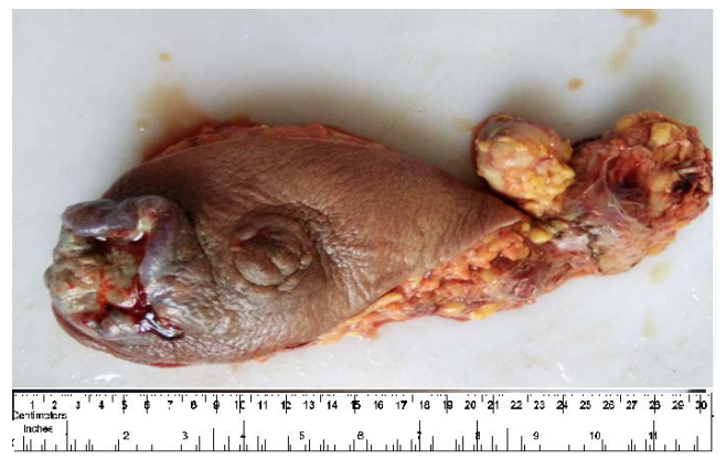
Figure 3. Image showing involvement of skin and nippleareola complex by tumour.

Out of the 45 patients, there were 39 patients having Infiltrating Ductal Carcinoma, NOS. There were 2