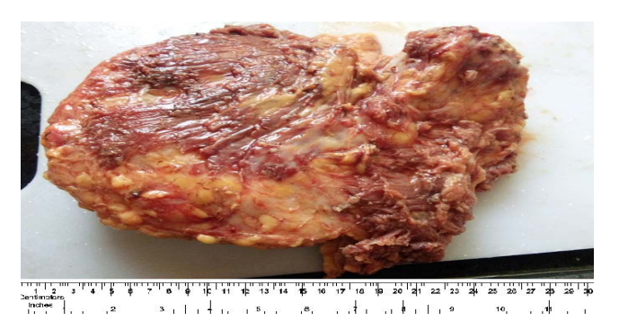
Figure 1. Specimen of carcinoma breast.

Breast carcinoma with most common pattern was that of Infiltrating Duct Carcinoma, Not otherwise specified (NOS) (Figure 4).