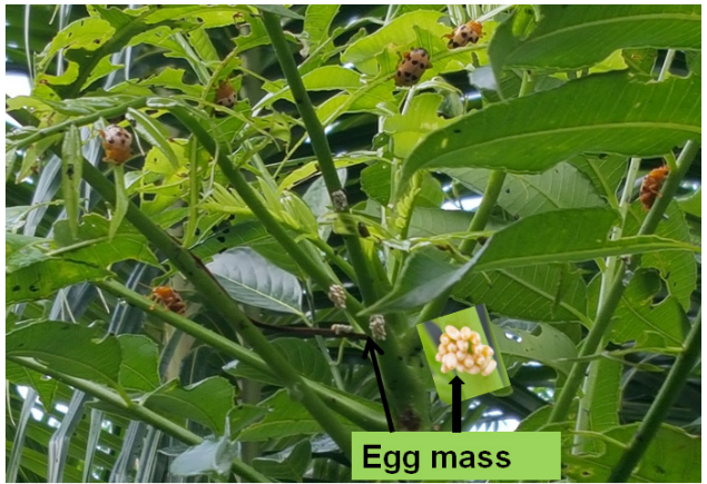
b) Adult beetles + egg mass of Podontia 14-punctata