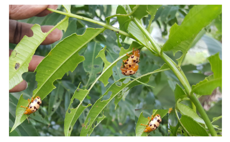
a) Adult beetles of Podontia 14-punctata