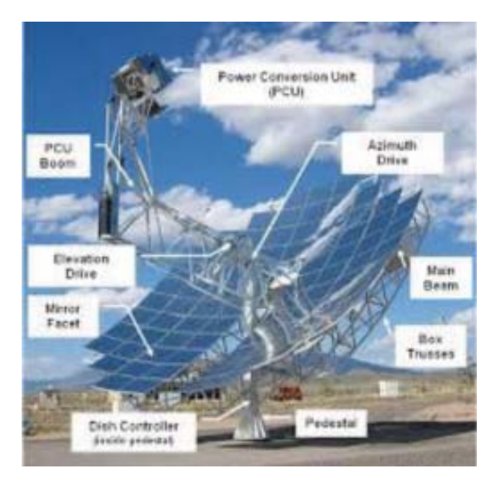
Fig.2. Dish stirling systes

Solar pond is a pool of salt water which acts as a large-scale solar thermal energy collector with integral heat storage for supplying thermal energy. A solar pond can be used for