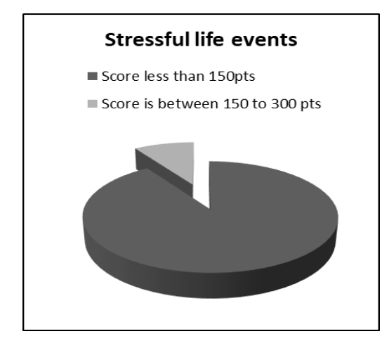
Figure 3. SRRQ score of stressful life events of fireworks workers during the pandemic.

Figure 2. Nutritional intake of fireworks workers in pre- and during pandemic period.